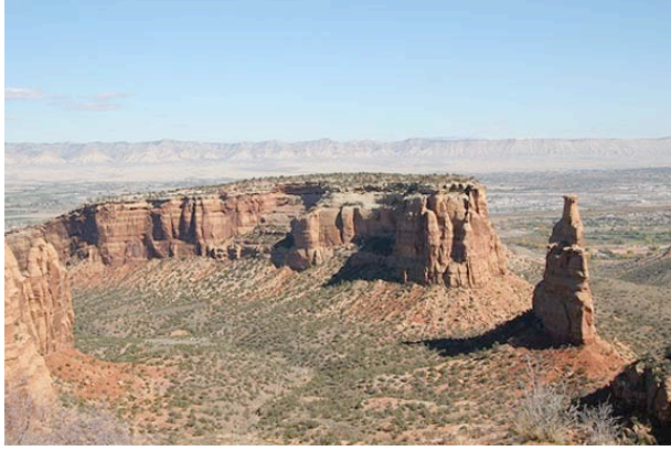
View from the Colorado National Monument, site of this year's star party.

You are cordially invited to attend our annual star party hosted by the Western Colorado Astronomy Club. This year the event will be held at a new site on the Colorado National Monument, elevation 5800 feet (1770 m). Only 15 minutes from downtown Grand Junction, this location offers a large area to accommodate almost any size vehicle from a sedan to a 40-foot RV. Thirty campsites are available on Loop-C and these will be filled on a first come, first served basis. There is also a large, paved parking lot available for observers who don't want to set up a permanent campsite.