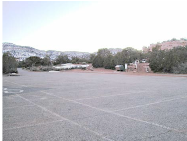
A paved observing site is available near the campground for attendees who don't plan to camp.