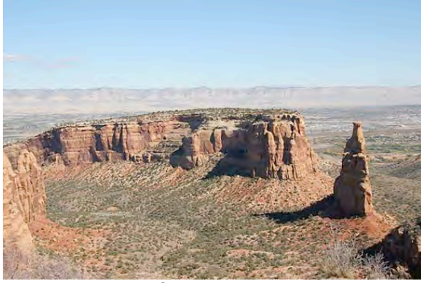
View from the Colorado National Monument, site of this year's star party.

You are cordially invited to attend our annual star party hosted by the Western Colorado Astronomy Club. This year the event will be held at a new site on the Colorado National Monument, elevation 5800 feet (1770 m). Only 15 minutes from downtown Grand Junction, this location offers a large area to accommodate almost any size vehicle from a sedan to a 40-foot RV. Thirty campsites are available on Loop-C and these will be filled on a first come, first served basis. There is also a large, paved parking lot available for observers who don't want to set up a permanent campsite.