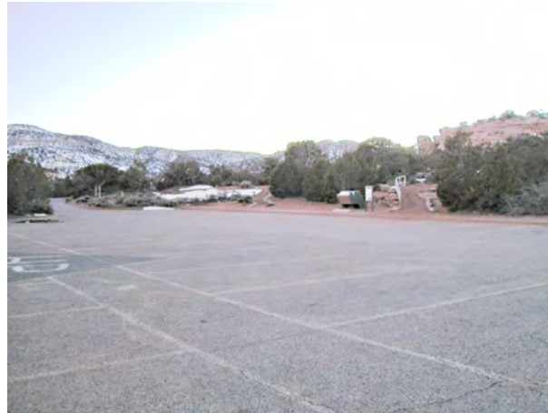
A paved observing site is available near the campground for attendees who don't plan to camp.