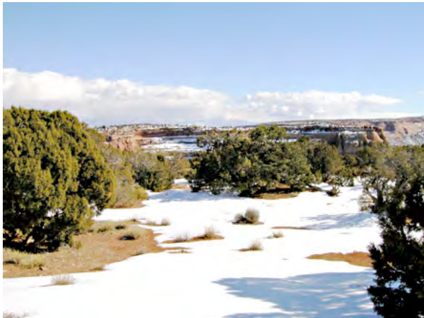
A Typical Campground Observing Site (no snow in June!)

You are cordially invited to attend our annual star party hosted by the Western Colorado Astronomy Club. This year the event will be held at a new site on the Colorado National Monument, elevation 5800 feet (1770 m). Only 15 minutes from downtown Grand Junction, this location offers a large area to accommodate almost any size vehicle from a sedan to a 40-foot RV. Thirty campsites are available on Loop-C and these will be filled on a first come, first served basis. There is also a large, paved parking lot available for observers who don't want to set up a permanent campsite.