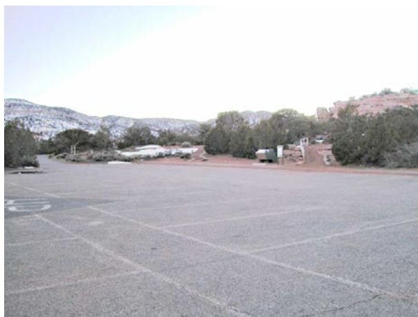
A paved observing site is available near the campground for attendees who don't plan to camp.