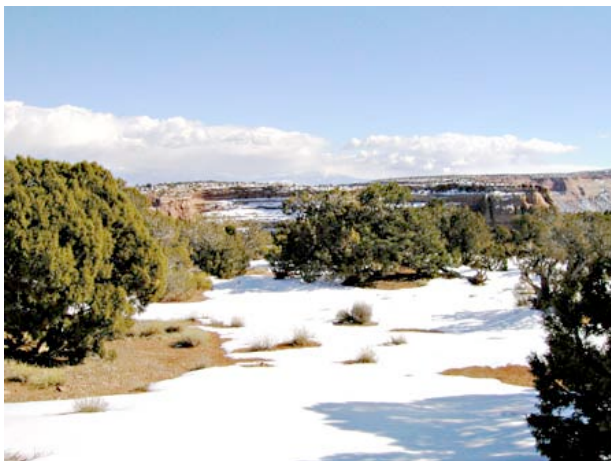
A Typical Campground Observing Site (no snow in June!)

You are cordially invited to attend our annual star party hosted by the Western Colorado Astronomy Club. This year the event will be held at a new site on the Colorado National Monument, elevation 5800 feet (1770 m). Only 15 minutes from downtown Grand Junction, this location offers a large area to accommodate almost any size vehicle from a sedan to a 40-foot RV. Thirty campsites are available on Loop-C and these will be filled on a first come, first served basis. There is also a large, paved parking lot available for observers who don't want to set up a permanent campsite.