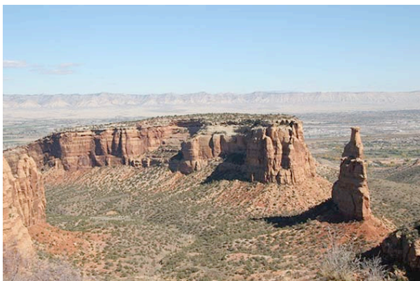
View from the Colorado National Monument, site of this year's star party.

You are cordially invited to attend our annual star party hosted by the Western Colorado Astronomy Club. This year the event will be held at a new site on the Colorado National Monument, elevation 5800 feet (1770 m). Only 15 minutes from downtown Grand Junction, this location offers a large area to accommodate almost any size vehicle from a sedan to a 40-foot RV. Thirty campsites are available on Loop-C and these will be filled on a first come, first served basis. There is also a large, paved parking lot available for observers who don't want to set up a permanent campsite.